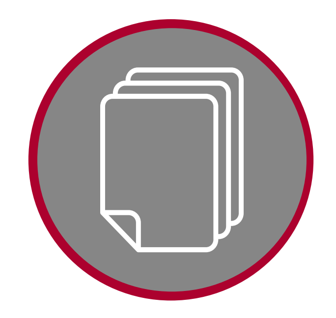
Education, Engagement, and Resource Development

Policy Research, Development, and Implementation