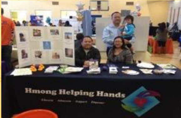
Hmong Resource Fair at the Eastside St Paul YMCA