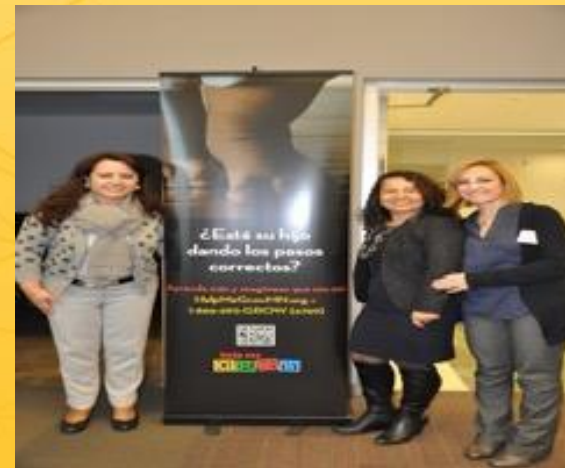
Help Me Grow Latino outreach