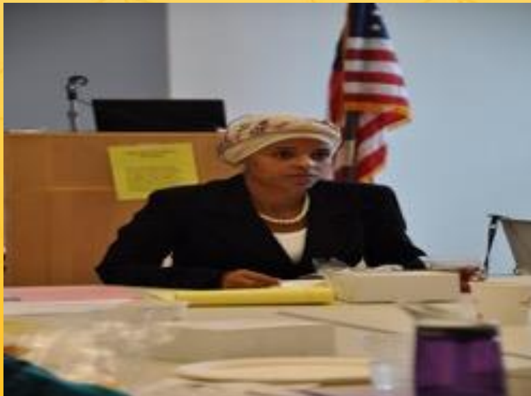
Somali delegate at Act Early retreat