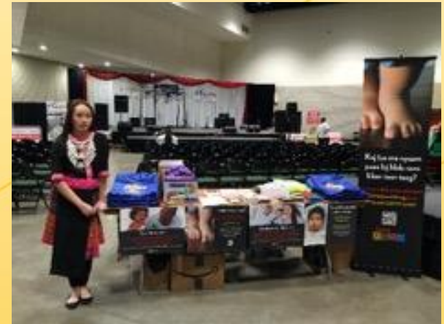
Hmong New Year in St. Paul, MN